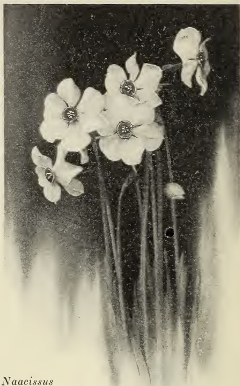
Narcissus Poeticus Ornatus

Poeticus Ornatus, pure white with orange cup edged bright crimson; fine for forcing or for massing in borders..... .10 .75 6.00